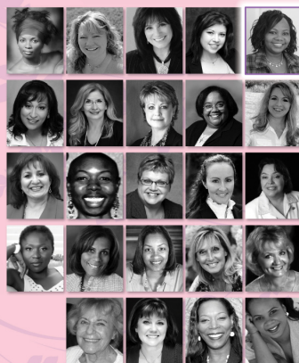
The Unstoppable Woman's Guide to Emotional Well-Being

Written by female authors, coaches, and professionals.